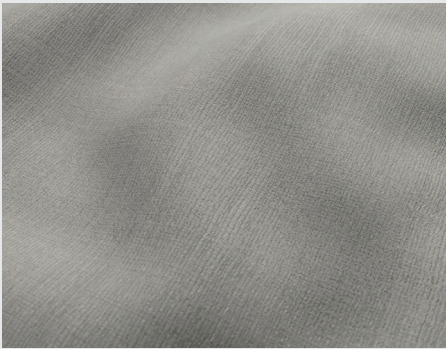
champagne 2586-43 145 cm