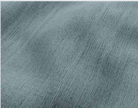
reef 2586-74 145 cm