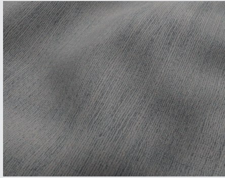
bonbon 2586-29 145 cm