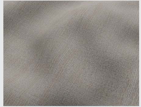
marble 2586-36 145 cm