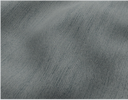
fossil 2586-12 145 cm