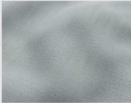
vapour 2586-50 145 cm